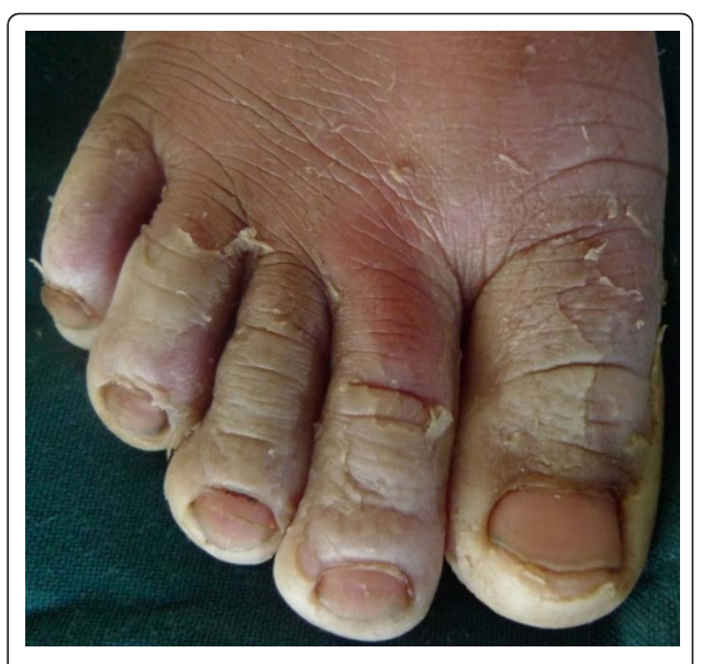
Figure 3 Right foot of 6 years old girl with peeling of the feet extending to the dorsum. It is more prominent on the toes. The toes are also macerated after wearing closed shoes.

Patients with continuous peeling of the skin were first reported as Keratolysis Exfoliativa Congenita [2]. This changed when in 1982 Levy and Goldsmith [5] described it as a peeling skin syndrome. Peeling skin syndrome is an extremely rare inherited skin disorder characterized by continual, spontaneous skin peeling (exfoliation). APSS is considered a subtype of peeling skin syndrome in which the peeling of the skin is limited to the dorsa of the hands and the feet [6,7]. The skin peeling is due to separation of the stratum corneum from the stratum granulosum [1]. Molecular studies among family members with APSS showed homozygous missense mutation in transglutaminase 5 (TGM5) [7,8]. Cassidy et al. [7] conducted a genome-wide linkage analysis and localized the genetic defect on chromosome 15 (at 15q15.2). This region contains nine genes with a small transglutaminase (TGM) gene cluster at its center. However, only TGM5 has a strong expression in the skin. The TGM5 enzyme is responsible for introducing \gamma -glutamyl- \epsilon -lysine isopeptide bonds into the structural proteins [9]. The weakness of these bonds leads to a split in a region between the