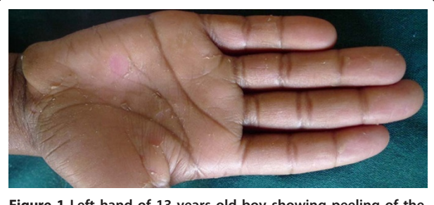
Figure 1 Left hand of 13 years old boy showing peeling of the palms.