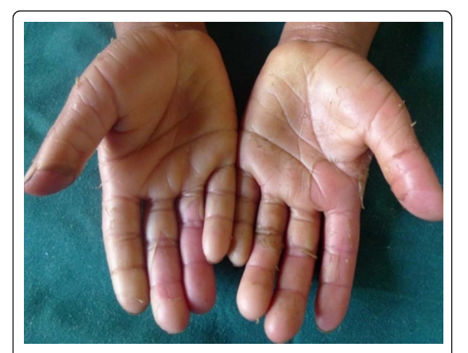
Figure 2 Hands of the 6 years old girl showing whitish thickening of the palms which peel leaving behind a soft erythematous skin.

Laboratory studies in some patients with peeling skin syndrome showed abnormalities in the levels of amino acids, plasma tryptophan, serum copper, ceruplasmin and iron binding capacity [10]. Clinically, APSS is asymptomatic peeling with residual erythema for a few days that later heal spontaneously without scaring [7,8]. The onset of APSS is variable, but in the majority of the cases reported, the disease developed shortly after birth. One of our patients presented with peeling from birth and the elder sibling at one year. These patients had an earlier