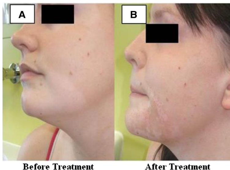
Figure 2 A set of 'before' and 'after' images showing hyperpigmentation used in the online discussion groups. A set of 'before' and 'after' images showing hyperpigmentation used in the online discussion groups. This set of images consent was gained from the individual seen in Figure 2 for use of their images in research publications as well as was obtained from images held at the Centre of Evidence Based Dermatology of before and after treatment. Full future studies.

initial survey work showed that this term was rather unhelpful to patients, who felt that it was vague, impersonal and rather 'medical'; or it implied that vitiligo was just something to be covered up (using cosmetic camouflage).