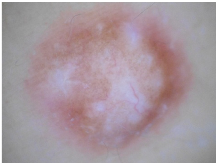
Figure 5 Different dermoscopic feature of leiomyoma. White cloud-like area without scar features.

The pigmented network pattern seems reasonably related to a reactive epidermal basal hyperpigmentation, as observed in the histologically confirmed lesions, due to