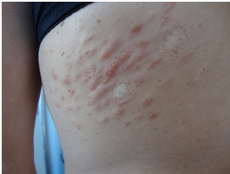
Figure 1 Clinical picture of the patient. Pink-to-brown papules and nodules on her left sub scapular region and both forearms.

Genetic analysis was performed using RNA extracted from a leiomyoma biopsy. Complete coding region sequencing of all 10 exons of Fumarate Hydratase gene (Gb #NM_000143) was evaluated using direct sequencing of RT-PCR amplified FH transcript. The sequence did not reveal nucleotide changes in coding region, due to the presence of amino acid substitutions. This does not exclude the possible presence of complex genomic mutations located inside introns, which could lead to abnormal transcripts. The level of enzymatic FH analysis should be investigated to further characterise the patients for FH activity depletion. Complete routine blood