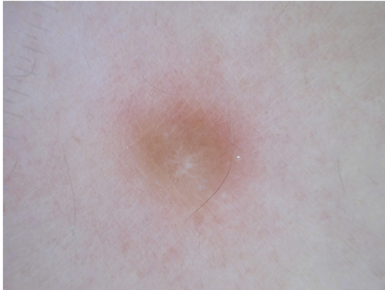
Figure 2 Dermoscopic feature of dermatofibroma of the patient. Central white scar like patch with delicate pigment network in dermatofibroma of the leg.

testing and urinalysis did not show anomalies. Abdominal computerized-tomography (CT) scan displayed uterine fibroids and normal appearing kidneys. Brain magnetic resonance imaging (MRI) showed one asymptomatic cerebral cavernoma (data not shown).