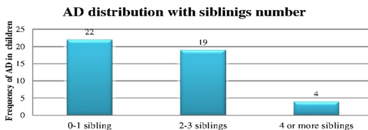
Fig. 2 Distribution of AD with number of siblinigs among children in Ayder referral hospital, Mekelle, Ethiopia, 2014

This study identified a magnitude of 9.6 % AD based on the AAD diagnostic criteria. The finding is slightly higher than studies conducted in the country at Ankober mobile clinic which was 4.67 % [23], and at Jimma 4.4 % [13]. However, it is less compared to studies from America 11 % [26], Argentina 41.1 % [27] and Japan 18.6 % [28] but still higher from the Tunisian study of 0.65 % [29]. The difference in the proportion of AD reported among the studies might be due to the geographical difference, use of different diagnostic criteria for diagnosis and the age group considered, study season and period. The possible reason for the higher magnitude compared to studies conducted in Ethiopia could be due to the study setting since the study is done at Ayder hospital which is the only referral hospital providing dermatologic services to patients at Mekelle town in the north part of Ethiopia.