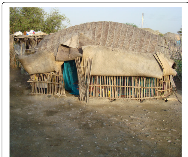
Fig. 1 Sheds made of palm leaves, a living place for people in Bashagard County, southeast of Iran

Students of study villages and their family were informed about the objectives and procedures of the investigation. The parents signed a consent form and the students