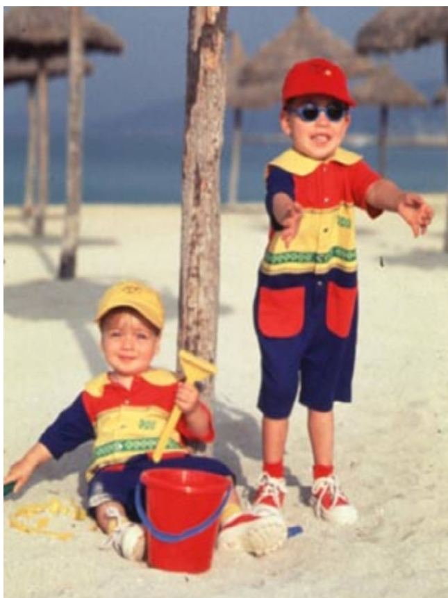
Figure 3 Example for a collection of sun protective clothing for children. The design of these clothes fulfills the requirements of the forthcoming European standard [4]