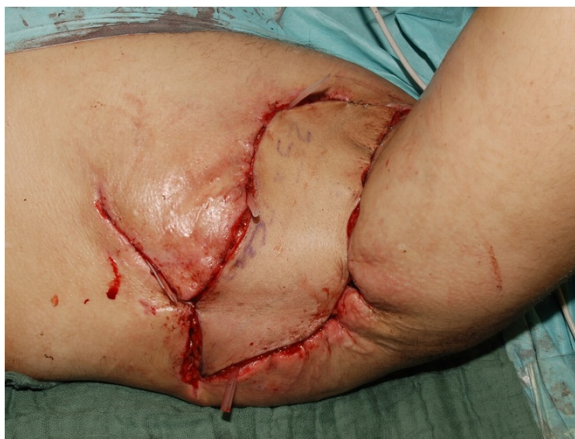
Figure 3 Adaptation of the ALTP flap after vascular anastomosis.

For lesions located on the perianal and the perineal regions, several techniques have been carried out including the use of bilateral transposition flap (Figures 5, 6, 7, 8, and 9) or the using of Gracilis musculocutaneous flap for severe lesions. Both techniques required preservation