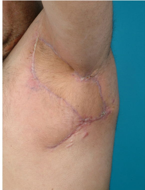
Figure 4 Post-operative photo demonstrates no healing abnormalities.

and showed good functional as well as aesthetic results (Figures 1, 2, 3, and 4).