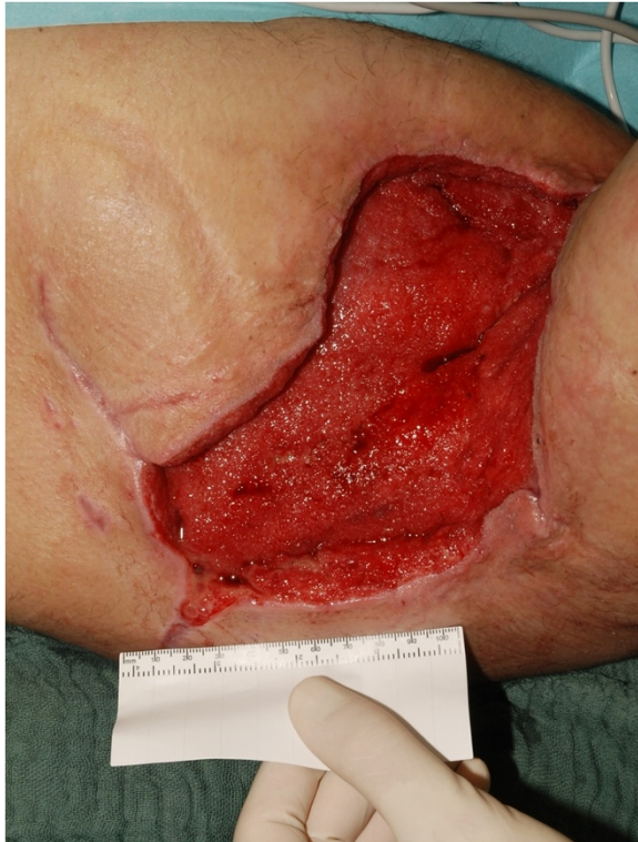
Figure 2 The resulted defect after wide surgical excision.