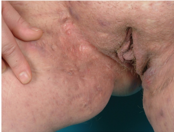
Figure 6 Bilateral Hidradenitis suppurativa (Hurley's Staging III) in the perianal, perineal and mons pubis showing the right side.