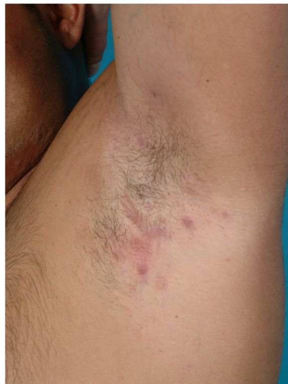
Figure 1 Hidradenitis suppurativa (Hurley's Staging II) in the left axilla.

Reconstruction of the axillary region included several techniques but primary closure and skin grafting were not performed based on expected complications such as contractures, excessive scarring. For those lesions in this area, rotation fasciocutaneous flap and transposition fasciocutaneous flap such as Limberg flap were performed successfully and showed good aesthetic as well as function results. Parascapular fasciocutaneous flap and even thoracodorsal artery perforator (TDAP) flap were selected for moderate to diffuse lesions. Massive lesions in the axillary region were reconstructed in 1 of our patients by the use of free (microvascular) tissue transfer in the form of anterolateral thigh perforator (ALTP) flap