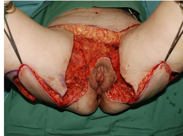
Figure 8 Bilateral transposition flap used to cover large defects bilaterally.

of the vulva and the anal sphincter. For lesions located in the gluteal and the trunk area, skin grafting was used successfully.