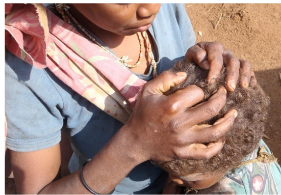
Figure 1 Teenage girl searching for and crushing head lice in a young child (East Kwaio mountains, Malaita Province, Solomon Islands).

Since we had difficulty locating evidence to inform local head lice guidelines in the Solomon Islands, we decided to do a systematic literature review of pediculosis in the PICTs. The aim of this review was to evaluate evidence in the peer reviewed literature on pediculosis due to head lice in the 22 nations that form the PICTs.