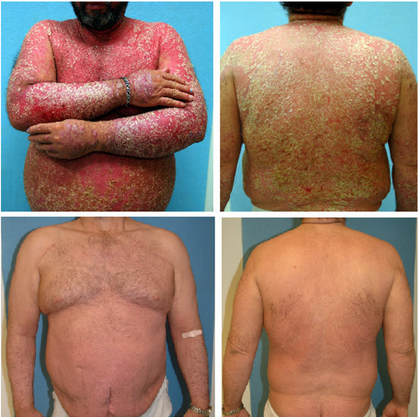
Figure 1 Clinical photos of patient 1 during the flare reaction in June 2004 (upper panels), with follow-up photos after standard-dose treatment with efalizumab for three months (lower panels).

associated with recurrence of her psoriasis. However, by June 2004 there was almost confluent severe plaque psoriasis again with features of erythroderma. The efalizumab