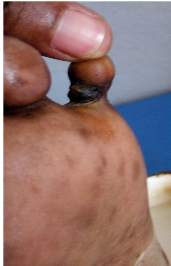
Fig. 2 Plantar view of the right fifth toe showing an annular constricting band at its base. The toe appears globular, oedematous and nearly amputated